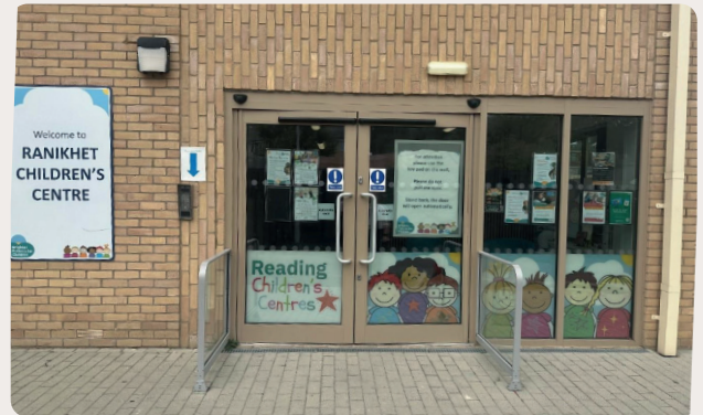
Ranikhet Family Hub Thurso Close, Reading RG30 4YH 0118 937 2885