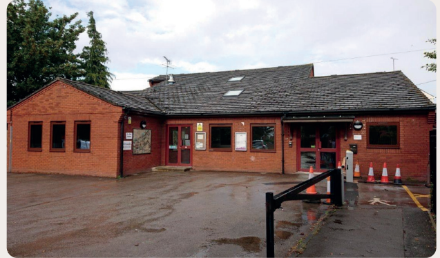
East & North Reading Family Hub Sun Street, Reading RG1 3JX 0118 937 2551