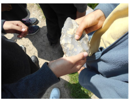
Travelling through time: Year 3 visited Butser Ancient Farm near Southampton to explore inside prehistoric houses and try prehistoric crafts including metal-working, chalk carving and clay modelling.