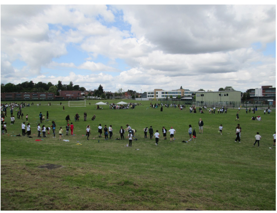
And they're off!: KS2 children and families enjoy their sports day.

The twist is that you can steal the bibs from other teams!