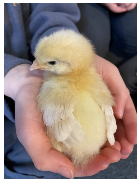
Saying hello: meeting a chick.

This was just one of the greatest experiences you can have in Alfred Sutton Primary School (ASPS).