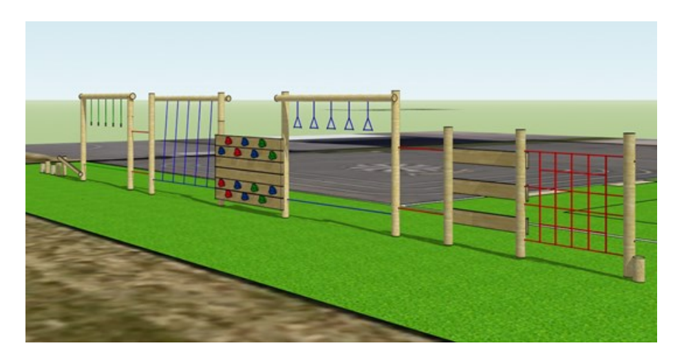
Aiming high: A plan for the trim trail on the Year 3/4/5 playground.

There are two phases. One is the trim trail of play equipment and