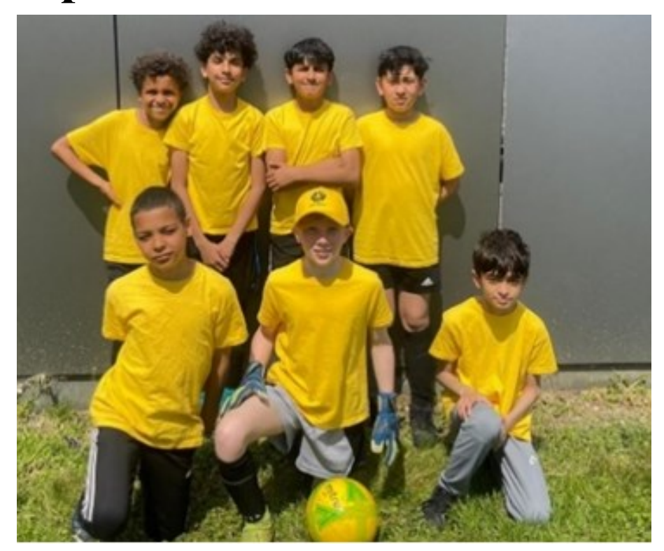
Working together: ASPS's A and B teams showed their team spirit.

Congratulations and well done to all of our fantastic players!