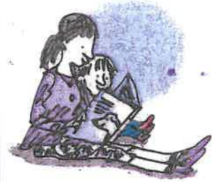
look at a book