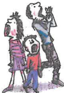
shout it out