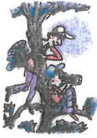
what can you see?