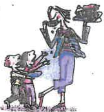
that's not fair