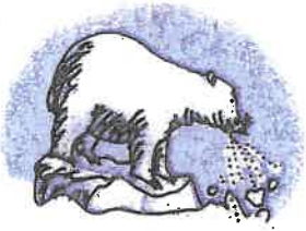
blow the snow