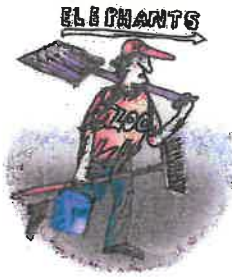
poo at the zoo