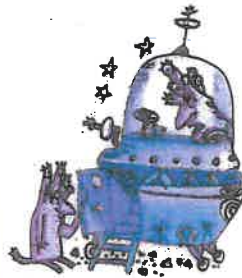
shut the door