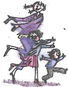
whirl and twirl