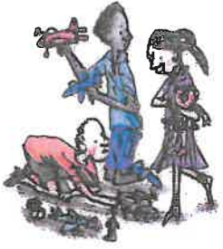
may I play?