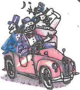
start the car