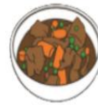
Got better food

Beatrix Potter was a British children's writer, illustrator, scientist and conservationist.