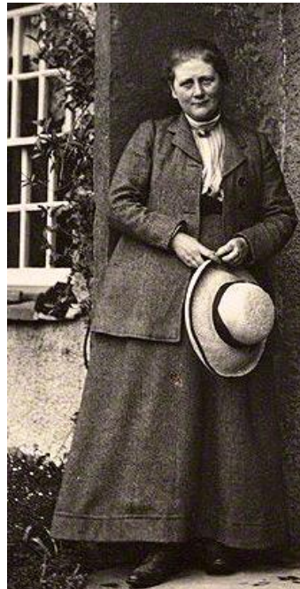
Beatrix Potter in 1913

From an early age, Beatrix Potter was interested in the natural world around her. She kept pets as a young girl and was really interested in the plants and animals that filled the countryside.