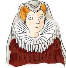
Mary Queen of Scots