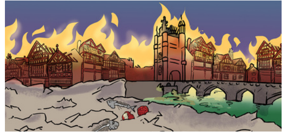
YEAR 2 GREAT FIRE OF LONDON 27TH MARCH 2025