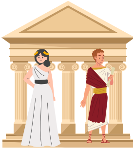
YEAR 3 ANCIENT GREECE 28TH FEBRUARY 2025