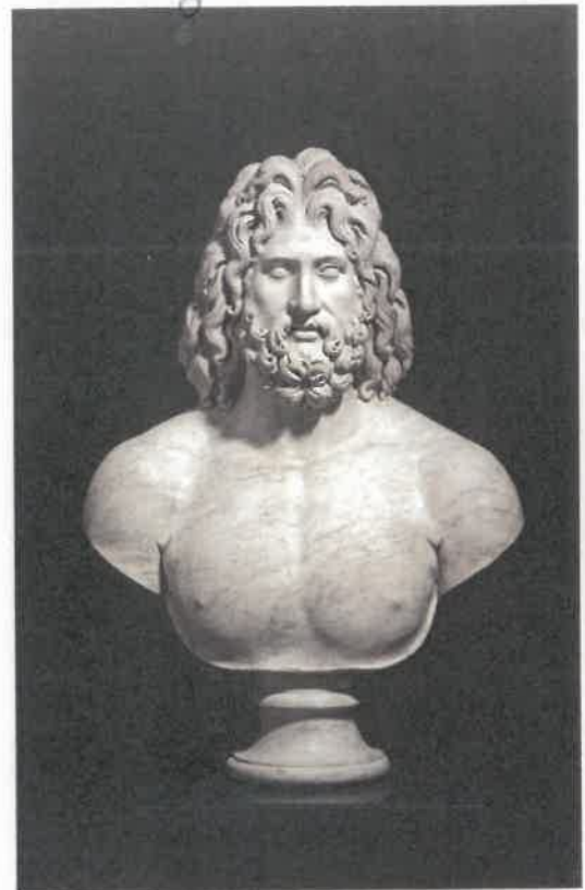
FIGURE 1.2 Bust of Jupiter

The shoulders and bare chest in this statue show Jupiter's strength. Jupiter's face has been carved with his characteristic beard. This bust dates from the 2nd century AD and is now part of the collection at The British Museum.