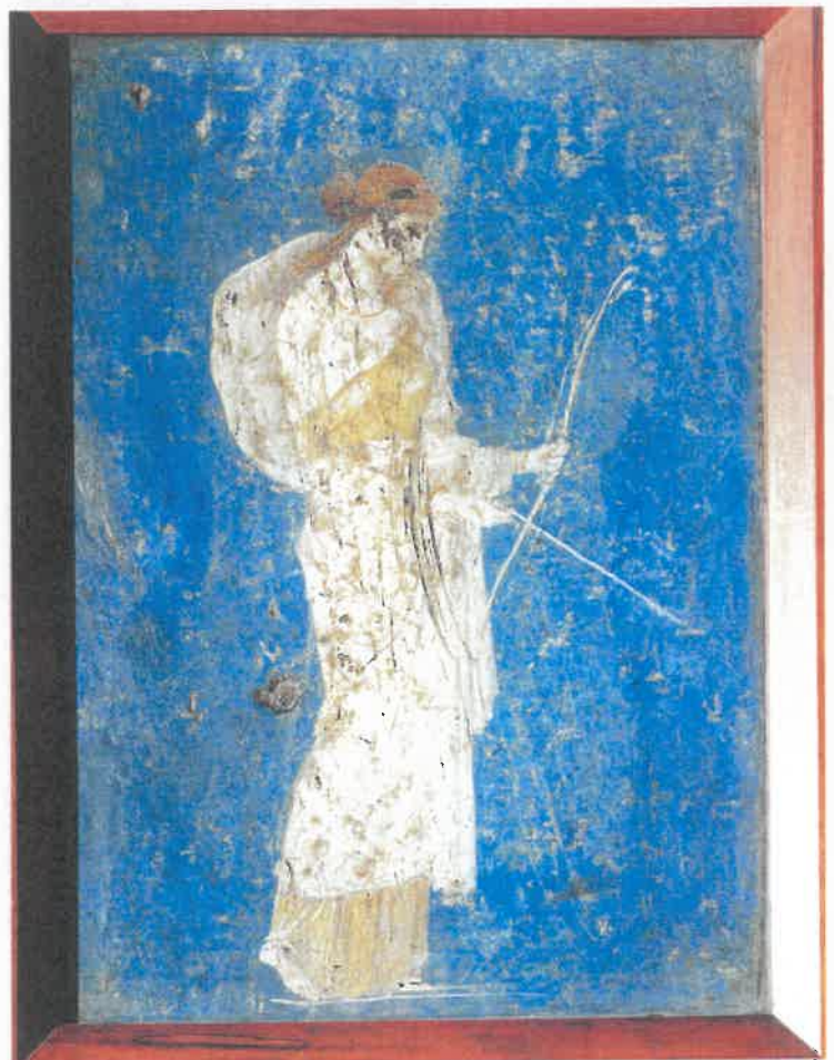
FIGURE 1.6 Roman fresco of Diana

The Latin verb abundavit means it overflowed . Explain the meaning of abundant .