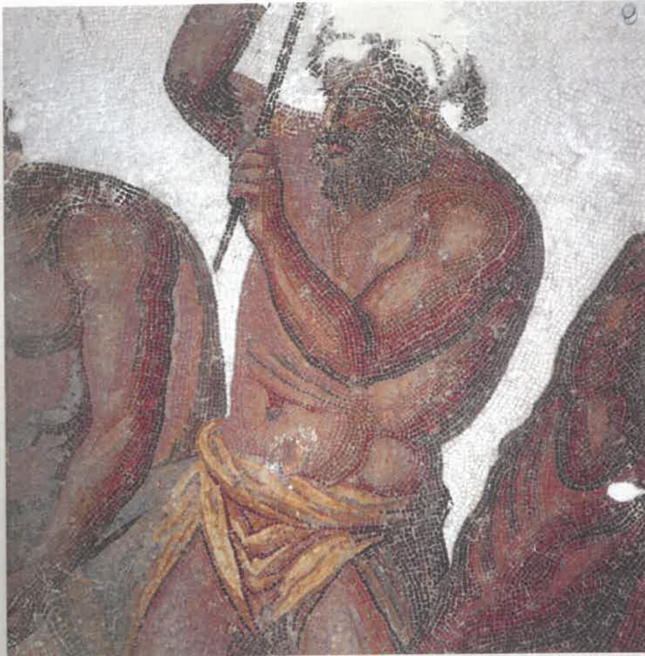
FIGURE 1.4 A Cyclops forging Jupiter's thunderbolts

According to myth, the Cyclopes also made weapons for the other gods, such as Neptune's three-pronged trident and Pluto's helmet of invisibility. This mosaic, which dates from the 3rd century AD, was found in Tunisia where it remains today in the Bardo National Museum.