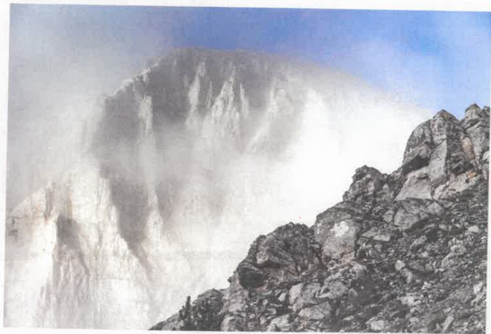
FIGURE 1.1 The summit of Mount Olympus

The most famous gods worshipped by the Romans are known as the Olympian gods . They have this name because they were paired with the major gods whom the Greeks had believed lived on Mount Olympus . Here is a list of the Olympian gods with both their Roman and their Greek names. You will see that the Romans believed that each god was associated with different things.