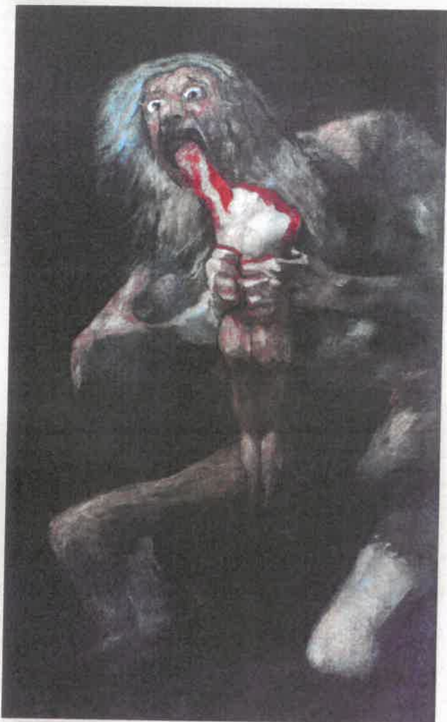
FIGURE 1.3 Saturn eating one of his children

This chilling painting of the Titan Saturn, the father of many Olympian gods, was created by the Spanish painter Goya towards the end of his life when he had seen a tremendous amount of death and destruction in the Napoleonic Wars. Notice how, in a mainly dark background, the bolting white eyes of Saturn and the red blood of his son stand out.