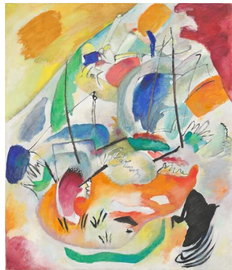
'Improvisation 13' (Sea Battle) (1913)

Wassily Kandinsky (1866-1944) was a Russian painter. Many people think he was the first abstract artist. Abstract art is a combination of colours, lines, and shapes that are not meant to be realistic.