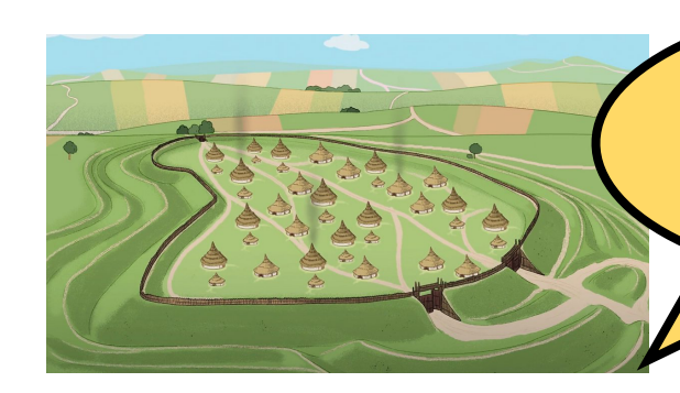
Diagram of an Iron Age hillfort