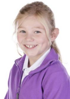
Y3 Maya School Councillor