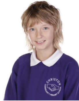
Ivy Rights Respecting Ambassador