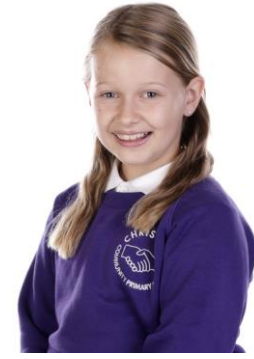
Olive House Captain