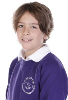
Y5 Theo School Councillor