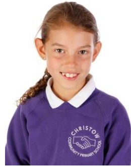
Ava Rights Respecting Ambassador