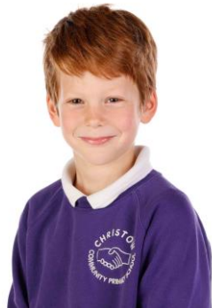
Y6 Ernie School Councillor