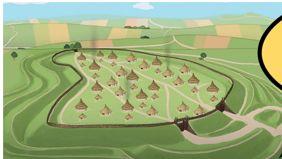
Diagram of an Iron Age hillfort