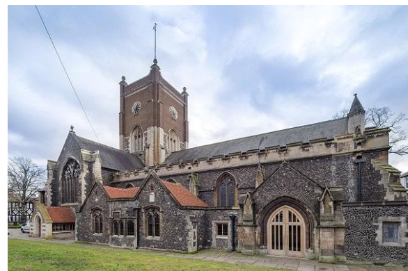
All Saints Church, Kingston