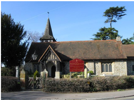
St Mary the Virgin Church, Church Lane

researched listed buildings in the Kingston area and the reasons why they were listed. These included the Coronation Stone, St Mary the Virgin Church, Clattern Bridge and All Saints Church.