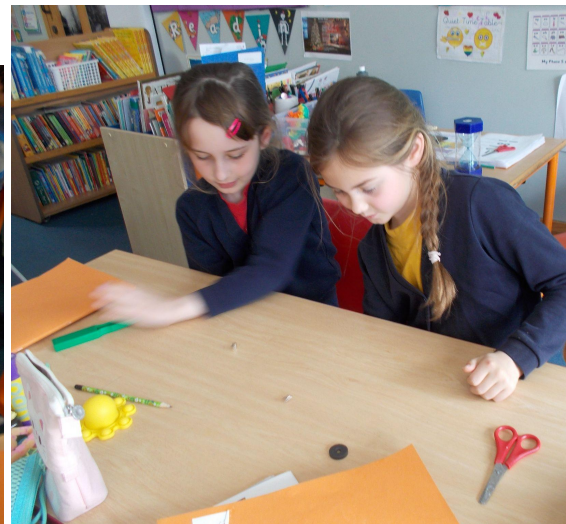
"We are moving magnets from underneath our table"