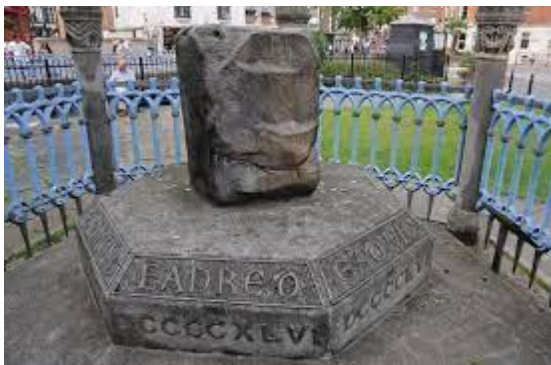
Coronation Stone, Kingston