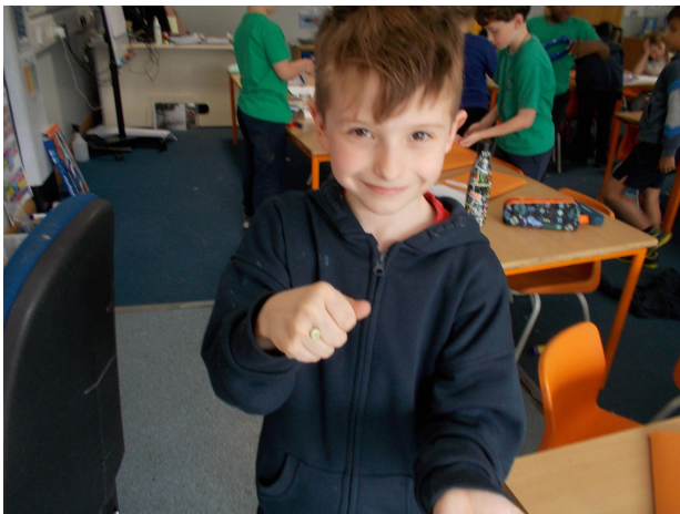
"My magnetic ring trick"