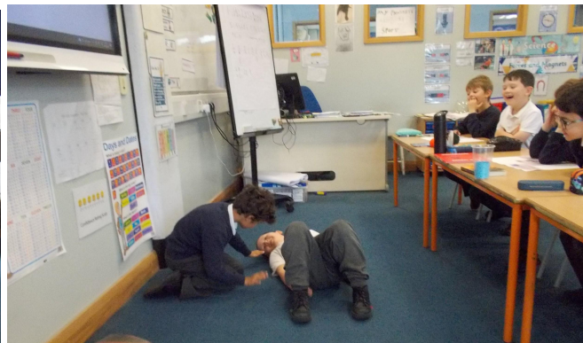
'Pebble in a river'