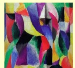
Bal Bullier 1913