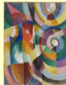
Electrical Prisms 1913