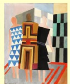
Simultaneous Dress 1925