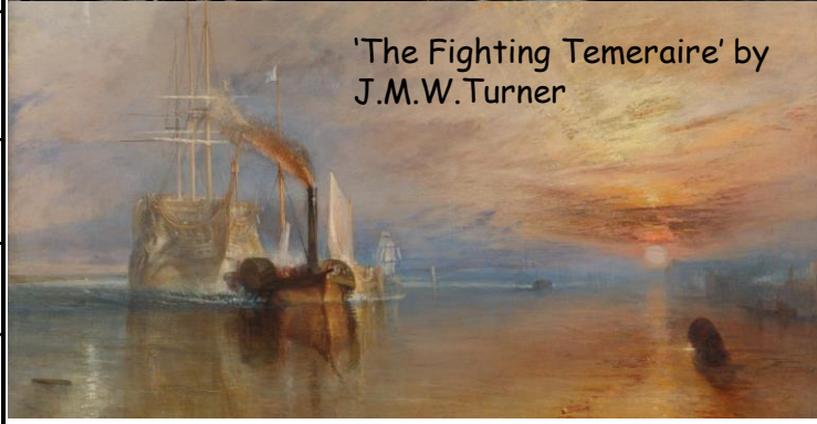
'The Fighting Temeraire' by J.M.W. Turner