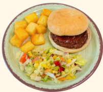
(vg) Plant Power Burger in a Bun (G)