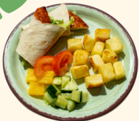
Chicken Fajita in a Wrap (G)