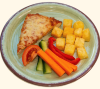
(v) Cheese & Tomato Pizza Wedge (G.D)