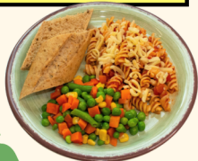
Tomato Pasta Bake (G.D)