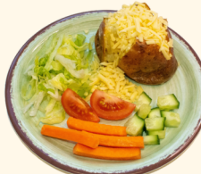
(v) Cheese D.