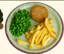
Salmon Fishcake (F.G)