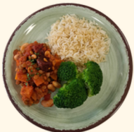
(v)(h) Hearty Rainbow Roots Chilli