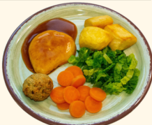
Roast Chicken Fillet (G)