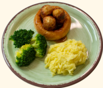
(v)(h) Plant Power Toad in the Hole (G.E.D)