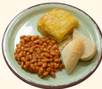
(v)(h) Cheese & Potato Pie (D.E)