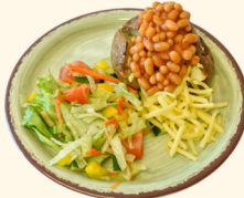
(v) Cheese/Beans D.