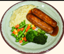
Pork Sausages (G.SU.SB)