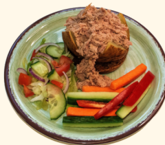
Tuna Mayonnaise F.E.