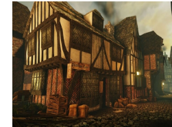
Pudding Lane, London