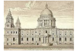
St Paul's Cathedral