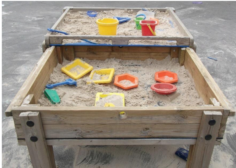
Sand and water to explore.