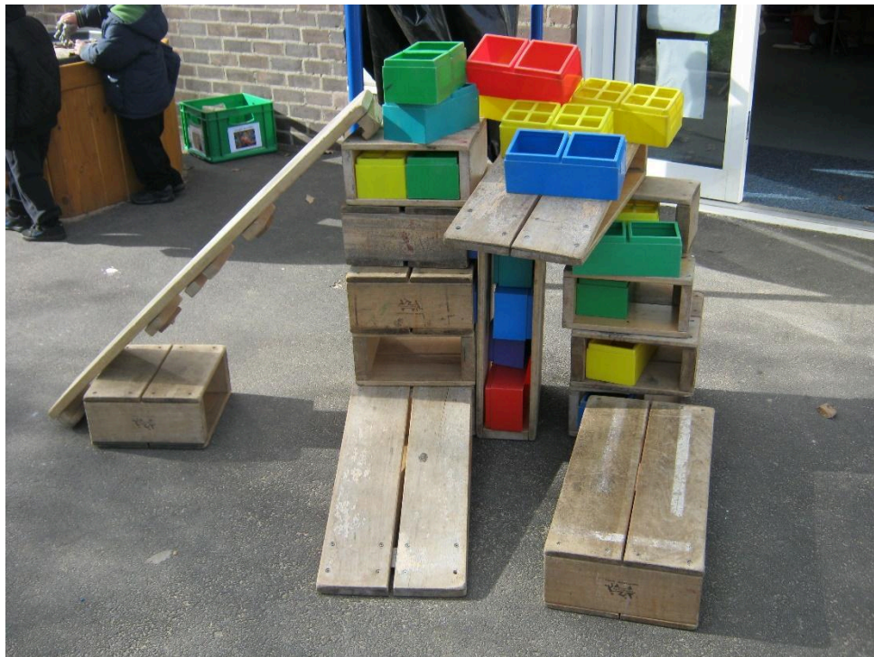
Wooden blocks and bricks.