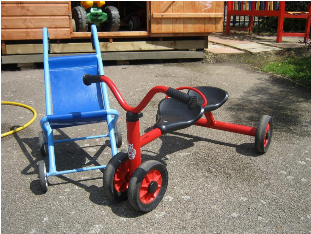
Bikes and pushchairs.....