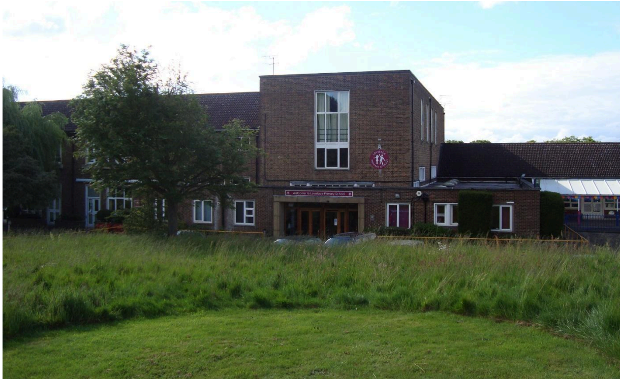
This is the front entrance of our school.