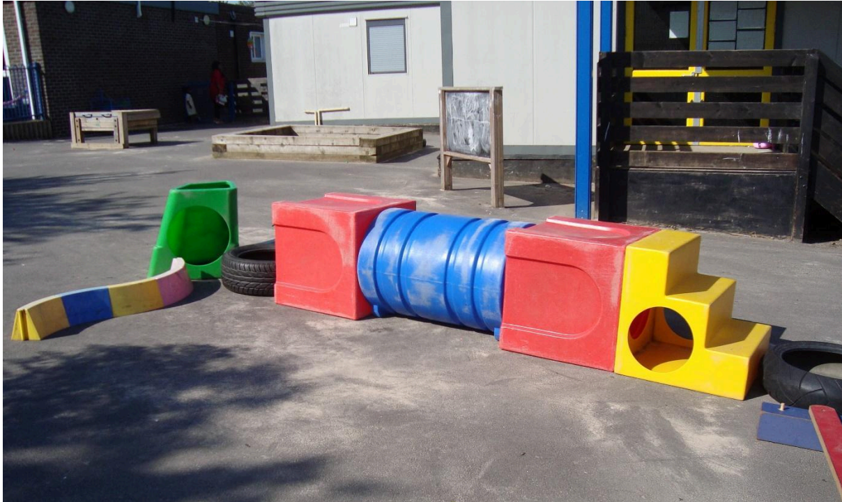
Climbing blocks to crawl in, over and under!

Dens we can make amongst the bushes and trees.