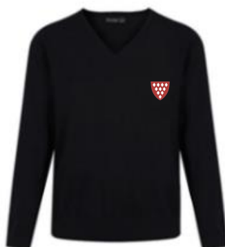
Black College Jumper (optional)