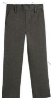
Grey Tailored Trousers