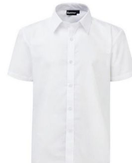
White long sleeve or short sleeve collared shirt