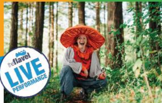
THE MUSHROOM SHOW SCRATCHWORKS THEATRE COMPANY

1 Adult & 3 Children or 2 Adults & 2 Children unless stated otherwise