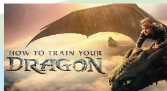
HOW TO TRAIN YOUR DRAGON (PG)