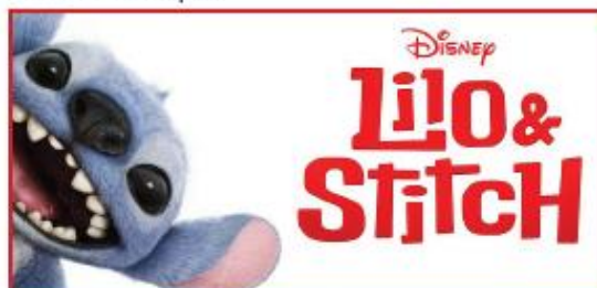
LILO & STITCH (U) Tue 5 Aug 2pm Wed 6 Aug 2pm Thu 7 Aug 2pm Fri 8 Aug 7pm Sat 9 Aug 7pm