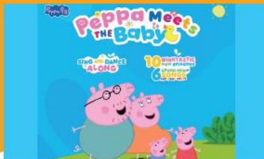
PEPPA MEETS THE BABY (U) CINEMA EXPERIENCE Fri 25 Jul 2pm