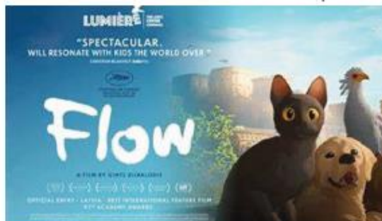
FLOW (U) Tue 29 Jul 2pm Wed 30 Jul 2pm Thu 31 Jul 7pm