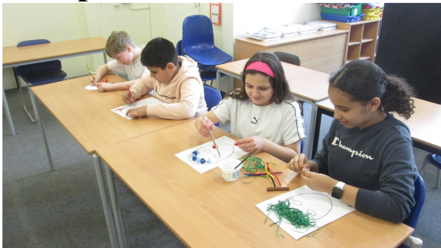
Artistic: Year 6s work on their projects during the arts week.