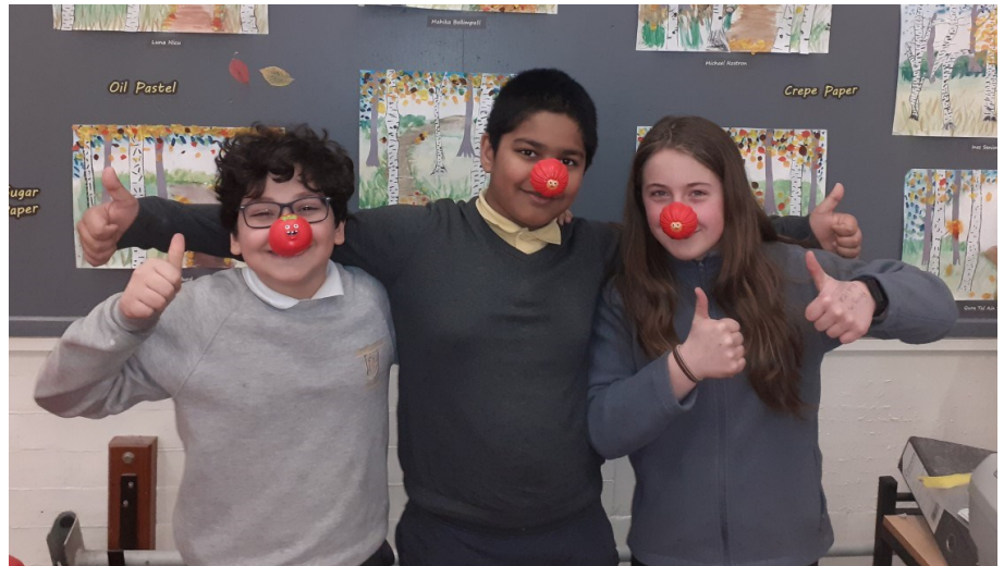
Thumbs up: Year 6 pupils get into the spirit of Red Nose Day.

Did you know? The day was originally called National Day of Comedy.