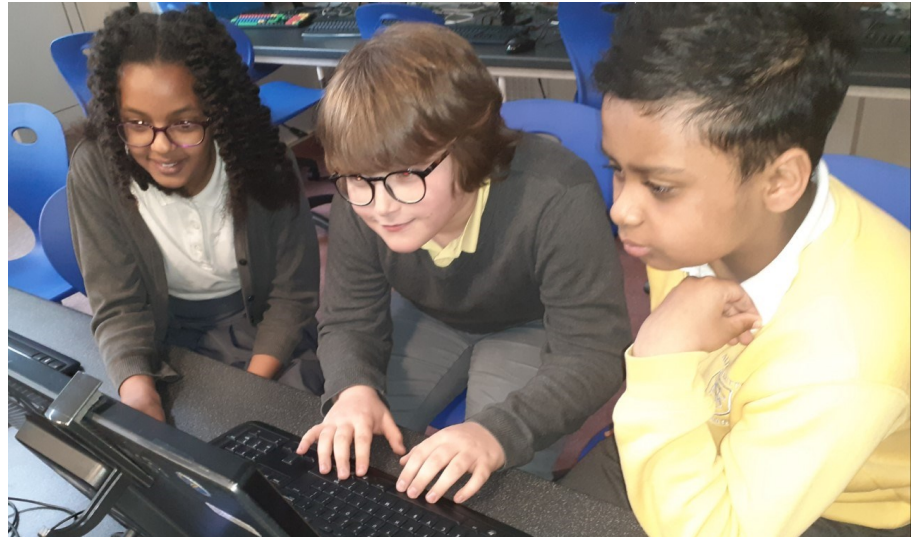
Staying safe: Year 6s remember their e-safety tips in the computing suite.

Safer Internet Day is about raising awareness for children and adults about