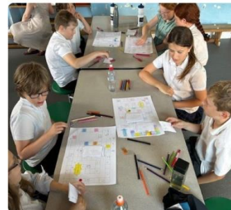
Dartmouth Academy pupils trained as mentors by Future First.