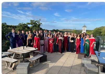
The pupils enjoy the Dartmouth Academy Prom at Dartmouth Academy.