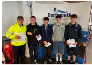
A group of staff and pupils celebrate GCSE results.