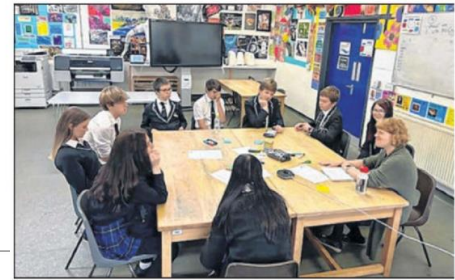
Children at Dartmouth Academy

Many of our pupils have achieved their full potential, with some going on to study at university and others starting their own businesses.