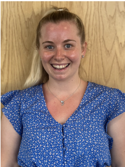
Miss Hoath Silver Birch Class