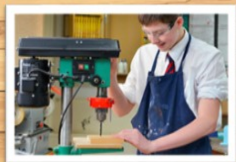
Safety in the workshop