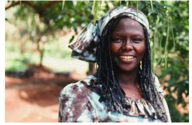
Wangari Maathai, Environmentalist

Environmentalists preserve and protect the natural environment. They advocate for sustainable practices and work hard to raise awareness about environmental issues.