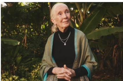
Dr Jane Goodall