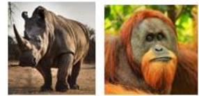
Yr 3: Rhino & Orangutan Classes