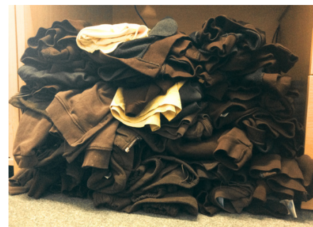
Unnamed uniform from our lost property this week

We also have a number of unnamed items of clothing, including coats and shoes, that will be available in our school lobby throughout next week. If you are missing anything please check here. Any items that aren't collected by next Friday, 1 st May will be donated.