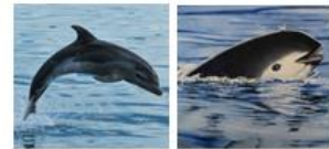
Yr2: Dolphin & Vaquita Classes