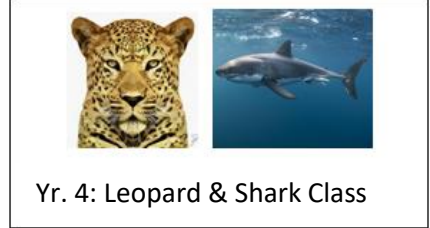
Yr. 4: Leopard & Shark Class