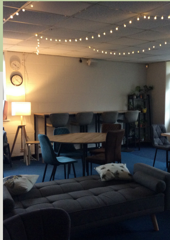
Year 5 Classroom

The UK has seen a rise in the number of children struggling with their mental health and wellbeing in primary schools. With everyone now focused on wellbeing as part of their agenda, there is one place that is being overlooked... the classroom.