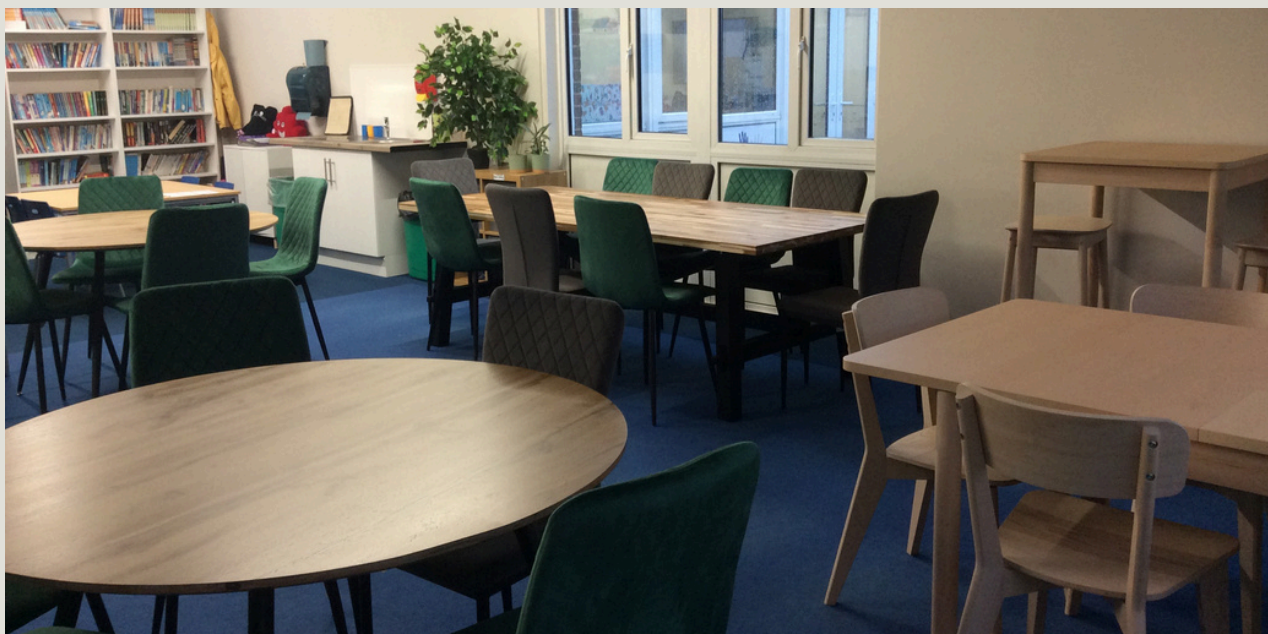
Year 6 Classroom